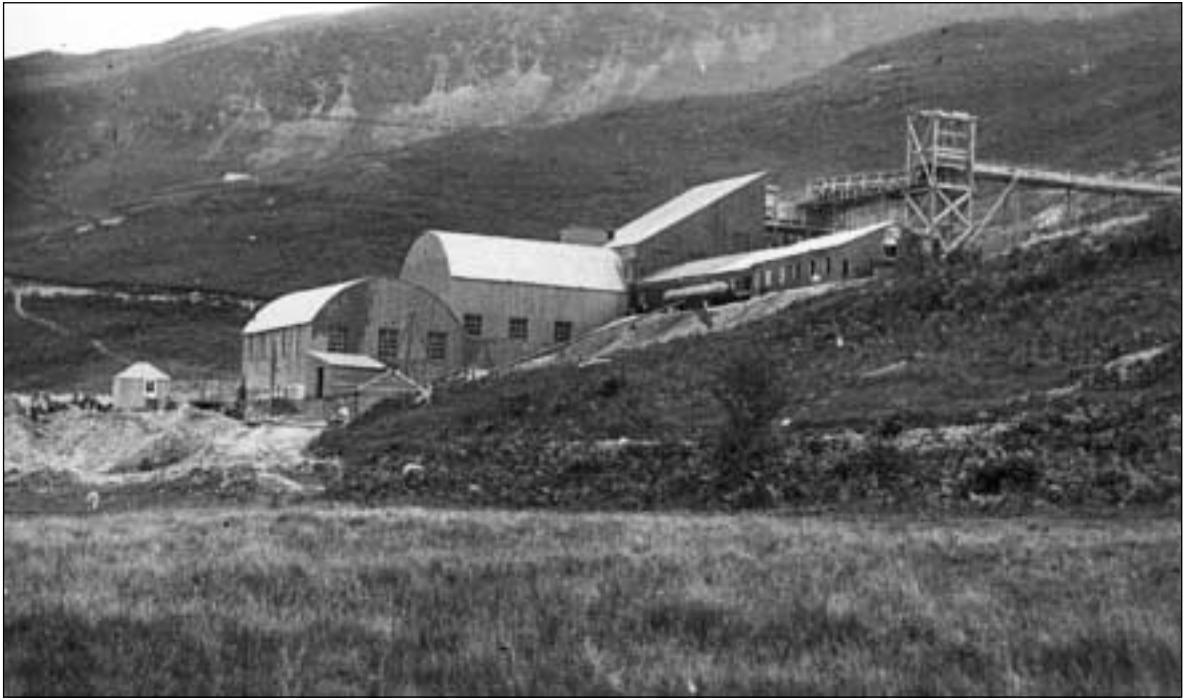
Gwaith Mwyn Bwlchglas ar ddechrau'r ganrif