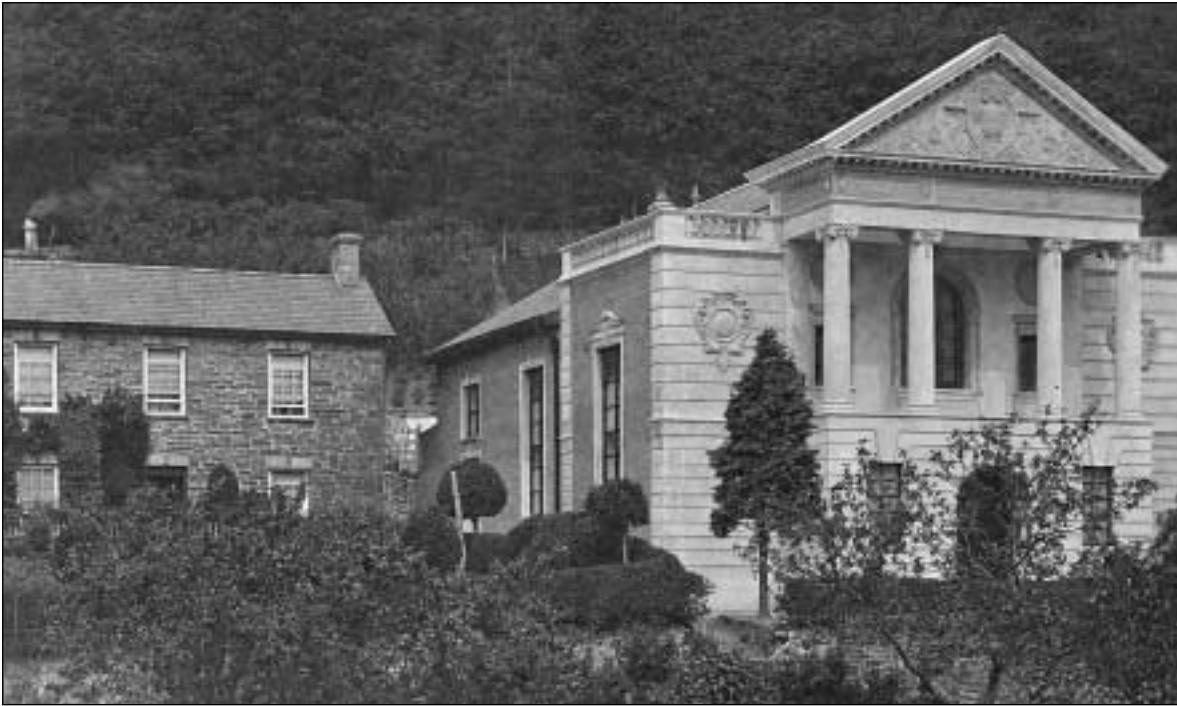
Capel Nasareth cyn 1953 pan dynnwyd y pileri i lawr.