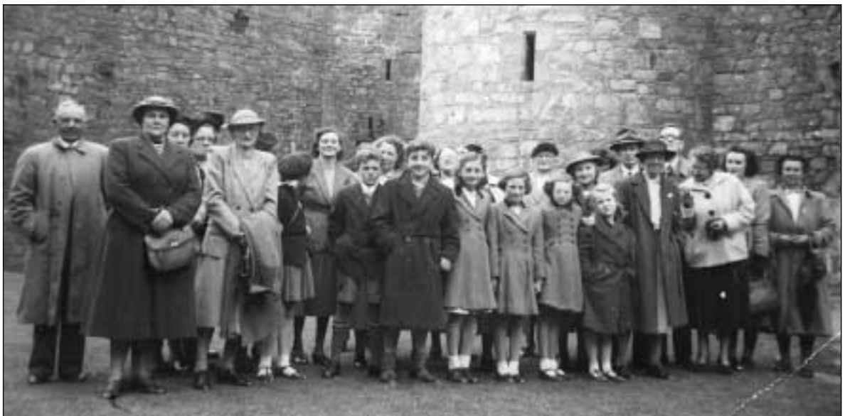
Taith Lenyddol Nasareth