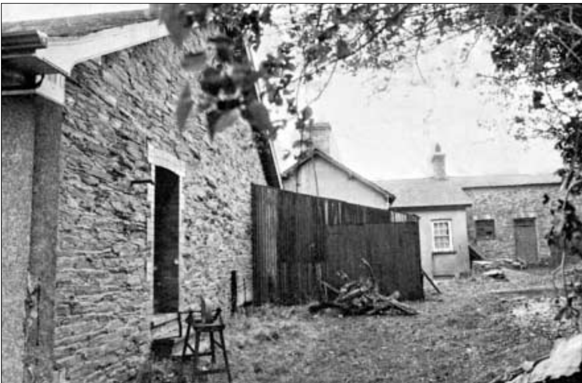
Y stabl tu cefn i'r capel ar y dde.